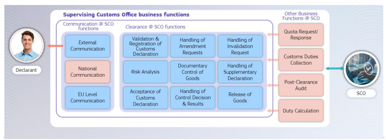
EU Centralised Clearance for Import (CCI), Phase 1 - Course takeaways

The diagram represents the functionalities of the EU Centralised Clearance for Import, Phase 1 System.